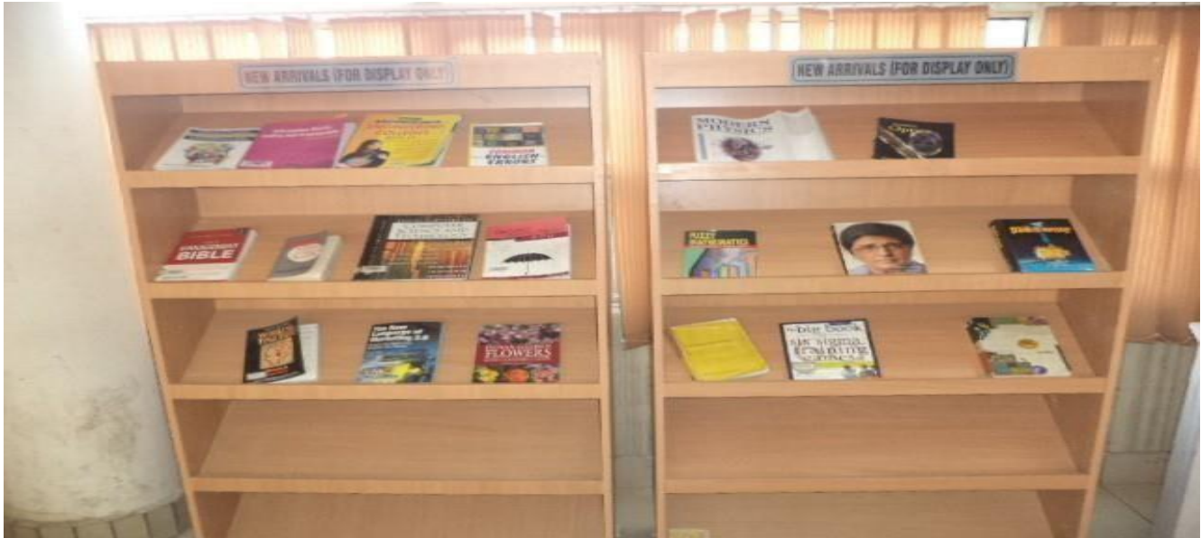
Display of New Arrivals

The Central Library has built up a good collection of books in Hindi, Punjabi, urdu and English.