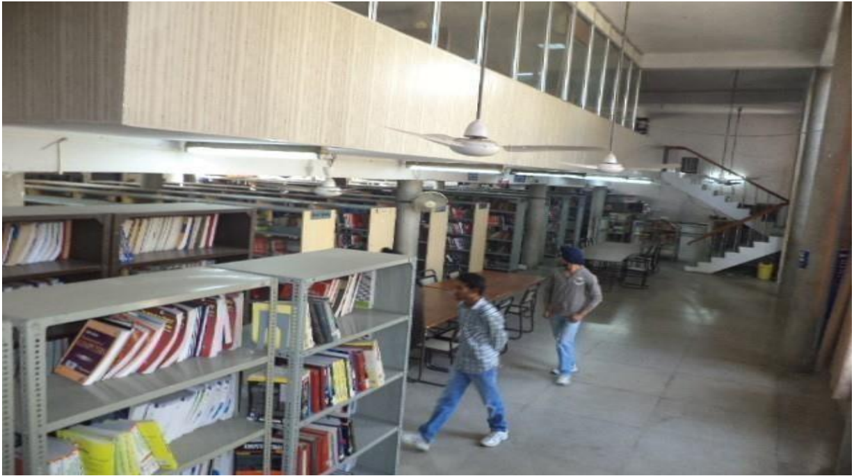
General Book Section, GNDEC