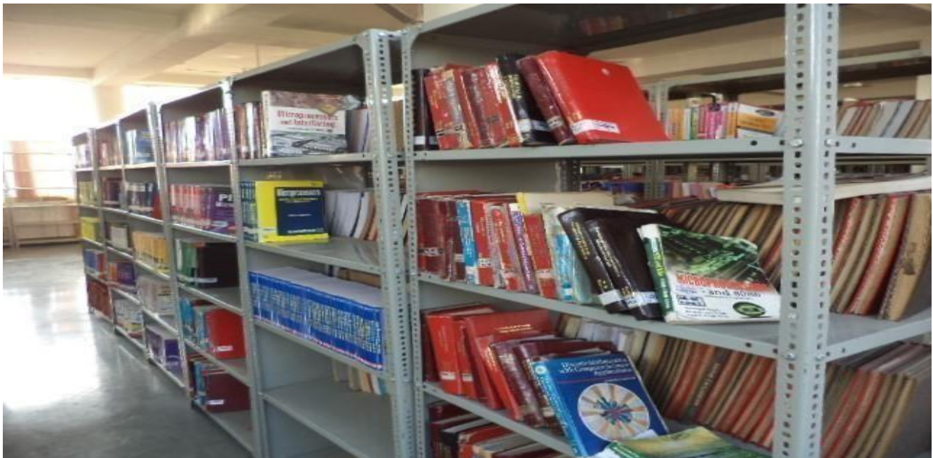
Book Bank Section