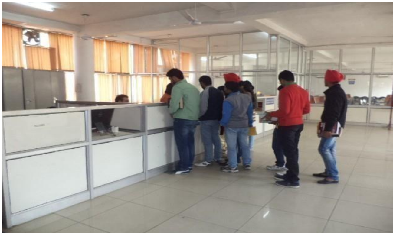
Circulation Section on Ground Floor, Central Library

In this section Issue/Return of books are done here. Every member can get membership of library after applying for membership on membership card. The card is/will available with information brochure of college. At the time of membership four reader tickets are provided to B. Tech, P G students. These reader tickets subject to renewed at the time of new semester after clearing the all books. If any student loss the reader tickets, he/she can get it duplicate after paying rupee 25 per tickets. At the completion of course / end of course No Due certificate will be given to students after returning the all books and tickets.