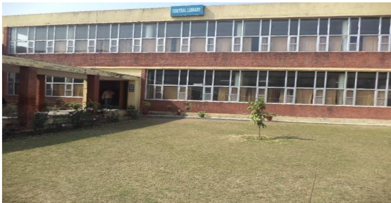
Central Library at GNDEC

The GNDEC Library System comprises of a Central Library and 8 departmental libraries that collectively support the teaching, research and extension programmers of the Institute. The Central Library houses a total collection of over 95,000 thousand documents comprising of books, theses, journals, video cassettes and compact discs in the fields of science, engineering, humanities, literature and management. All in-house operations in the library are fully computerized using the e-Granthalaya software package that also provides web-based access to the online catalogue of Library.