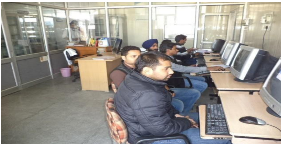
Computer Campus in the Central Library (First Floor, Reference section)

The Computer Applications Section coordinates with all Sections of the Library for library computerization. The Section is responsible for offering computer-based library services. It has servers and staff room as well as a Computer Laboratory that houses 10 computers exclusively for the library users.