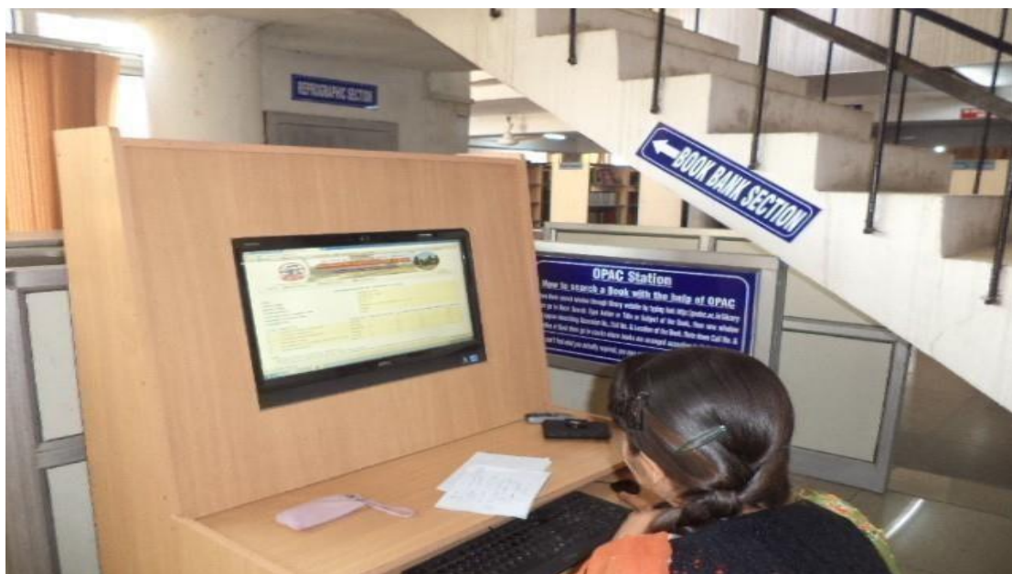
OPAC Access Point in the Library