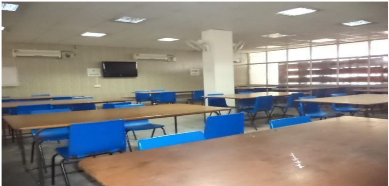
Reading Section, Reference Section (First Floor)

The Library maintains a separate reference collection consisting of encyclopedias, dictionaries, handbooks, technical data, almanacs, atlases, bibliographies, etc. The reference collection is organized in the following sub-categories: