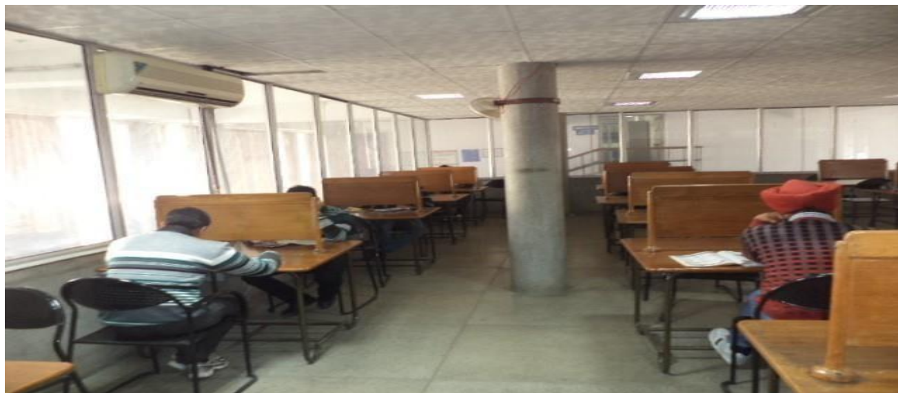
Reading Area in the Central Library (Top Floor)

The Journals Section deals with all activities related to subscription to print and electronic journals, their receipt, display, follow-up and enabling access to e-journals on the Campus LAN. The Library subscribes to 140 current journals (print with online) and has access to more than 6,000 e-journals as a member of the INDEST-AICTE Consortium.